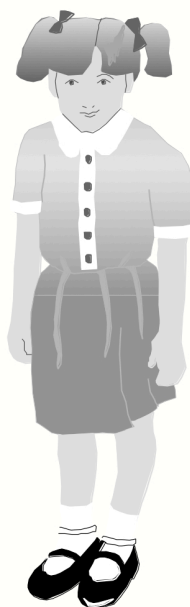
CHILD'S Age: 5-8 Years Sizes: 8\frac{1}{2} - 12