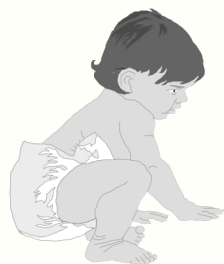
INFANTS Age: 0-24 Months Sizes: 0000 - 6