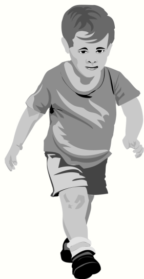
TODDLER Age: 2-5 Years Sizes: 6\frac{1}{2} - 9